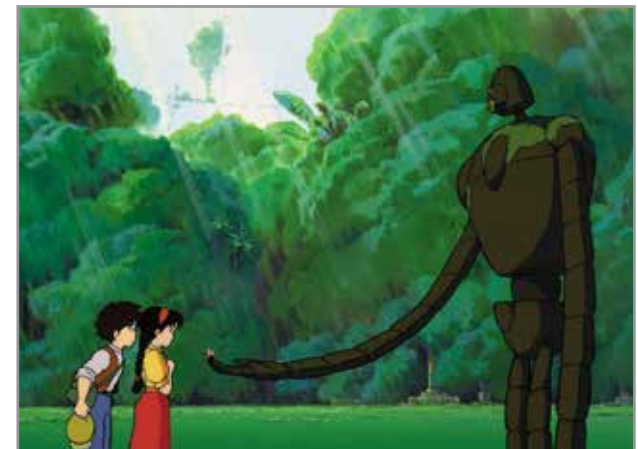
© CASTLE IN THE SKY (TENKŪ NO SHIRO LAPUTA) 1986, STUDIO GHIBLI