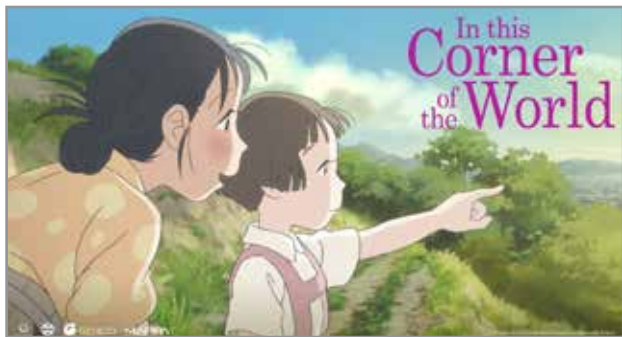
© SANJO KUNIO/FITIMASHI KONOSKE & MIYAZAKI PRODUCTIONS