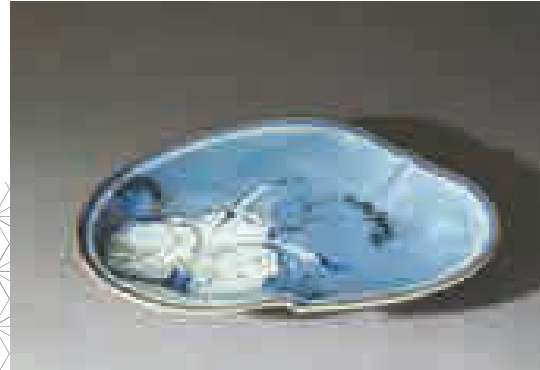
Caption : A porcelain dish made in Japan in the 1730s depicts a heron in blue, gold, and silver glazes.

In Japan, the white heron is seen as a special bird because it can move between three elements: air, earth, and water. The bird can also be seen as a sign of good luck and a bringer of good harvest. Herons, or sagi in Japanese, are commonly found standing in rivers, marshes, and rice paddies on long slim legs with a curving neck and long pointed beak.