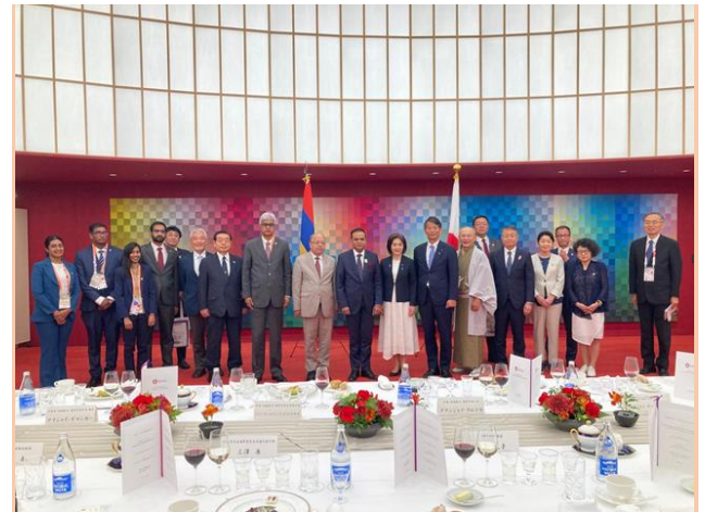
Group photo of the Attendees at the Luncheon