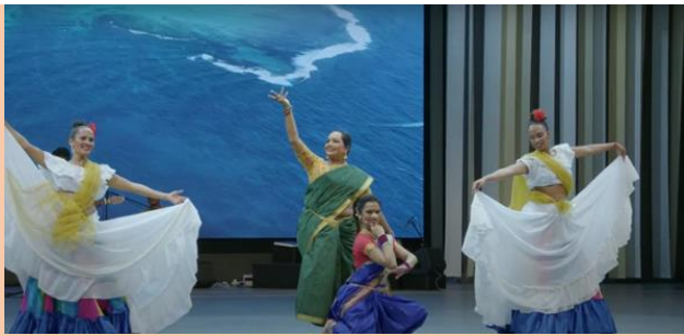
Performers from Mauritius

The Pavilion of Mauritius, located in Commons A, drew crowds with its immersive exhibits using Virtual Reality (VR) focusing on marine biodiversity, sustainable tourism and environmental conservation. A key highlight is the coral reef aquarium installation, in collaboration with Mitsui O.S.K. Lines, reflecting the commitment of Mauritius in preserving its natural heritage.