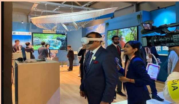
Virtual Reality experience

The Pavilion of Mauritius, located in Commons A, drew crowds with its immersive exhibits using Virtual Reality (VR) focusing on marine biodiversity, sustainable tourism and environmental conservation. A key highlight is the coral reef aquarium installation, in collaboration with Mitsui O.S.K. Lines, reflecting the commitment of Mauritius in preserving its natural heritage.