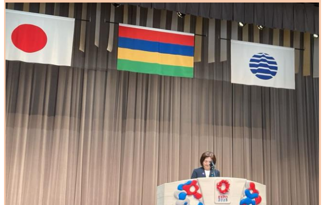
Ms. IKUINA Akiko delivering her welcome speech

The event started with a welcome by Ms. IKUINA Akiko, Parliamentary Vice-Minister for Foreign Affairs of Japan and was graced by the presence of the Mauritian delegation, led by the Hon. Dhananjay Ramful, Minister of Foreign Affairs, Regional Integration and International Trade, who participated in the flag-raising ceremony and delivered his address.