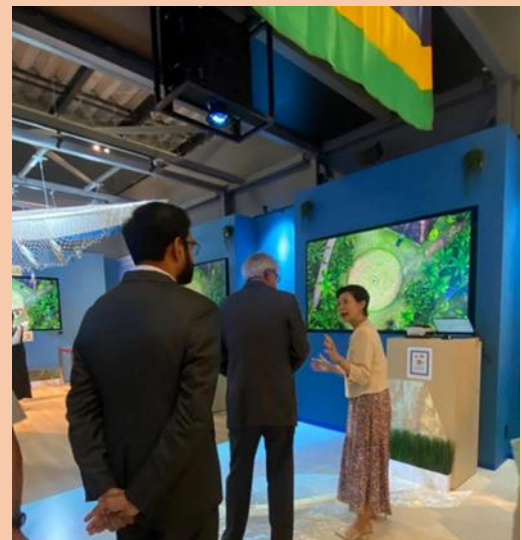
Her Imperial Highness Princess Takamado visiting the Mauritius Pavilion

On 7 July, in a moment of cultural diplomacy, Her Imperial Highness Princess Takamado of Japan visited the Mauritius Pavilion at the Osaka World Expo 2025.